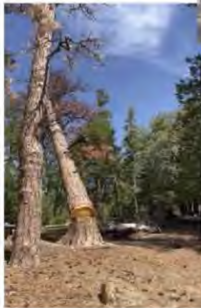
On its way.