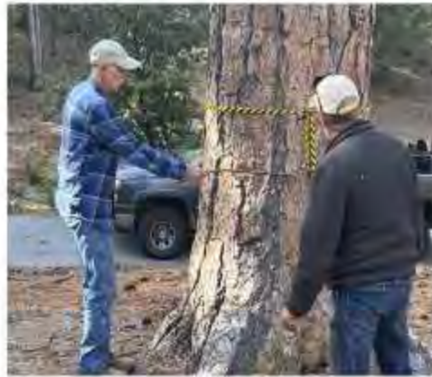
Devising a plan

A few weeks ago, a couple of us had the opportunity to help the Forest Service remove some hazard trees from some campgrounds ahead of their Memorial Day openings. First off, I joined some FS reps to scout out what needed to be done. We headed to the Fern Basin and Marion Mountain campgrounds to identify what needed to be done.