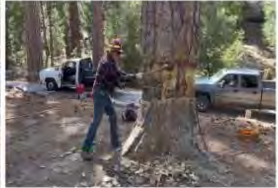
Chopping out the face.