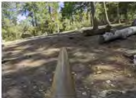
Sighting the landing zone.