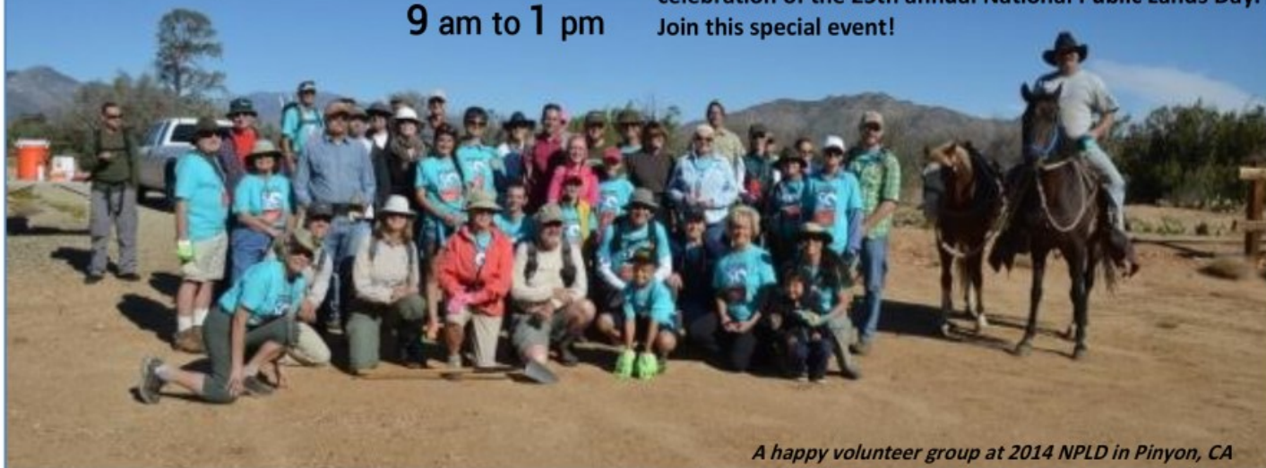
A happy volunteer group at 2014 NPLD in Pinyon, CA

Volunteers across the country, including Redshank Riders Backcountry Horsemen will visit their favorite parks, beaches, wildlife preserves and forests to give back to the treasured lands where we play, learn, and relax in celebration of the 25th annual National Public Lands Day. Join this special event!