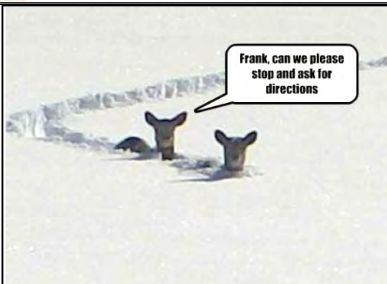
A little giggle