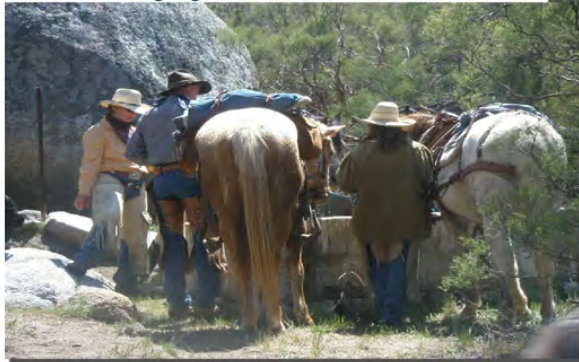
Watering the animals and lunch at Culp Spring