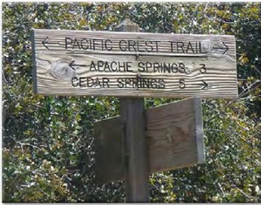
Signage at the PCT junction