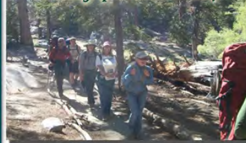
Heading up to Round Valley