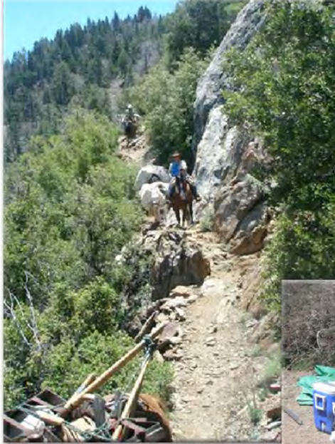
Pucker value at about a 9