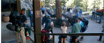
Packers gathered for a briefing