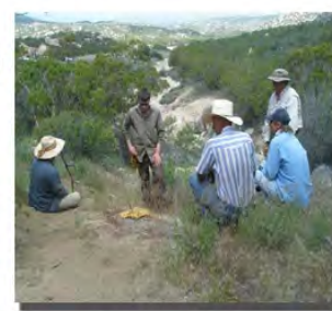
Gathered at the Tule Peak Trailhead