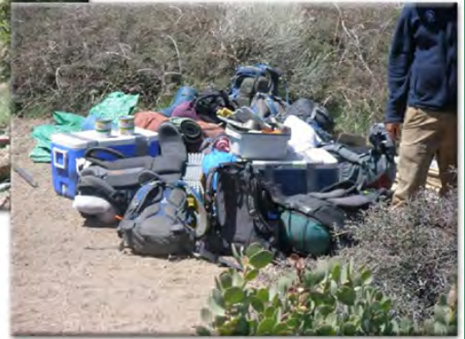
All delivered safely