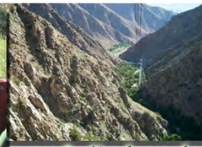
Looking down to the bottom of the tram