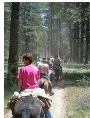
Ridng thru the pines