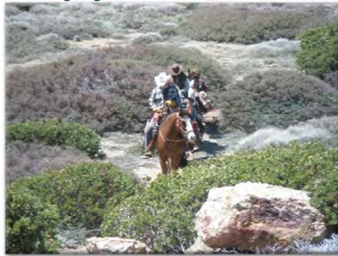
Leaving Apache Peak headed into a 30 mph wind