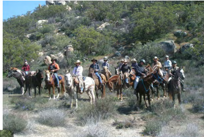
Group shot at the Tule Peak trailhead