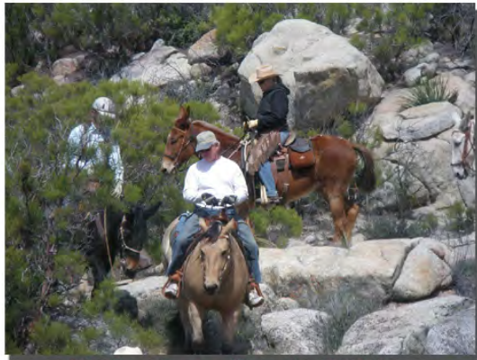
Challenging trails in the BMW