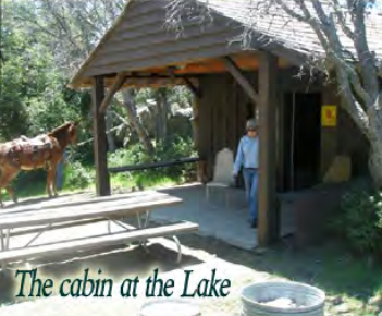
The cabin at the Lake