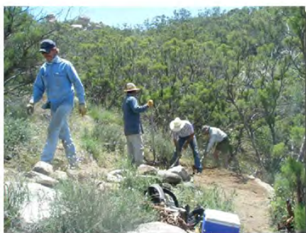
Working on a proper switchback