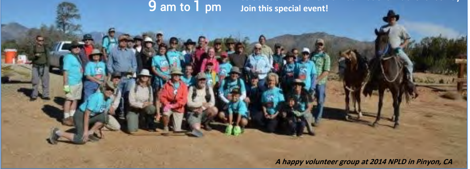
A happy volunteer group at 2014 NPLD in Pinyon, CA

Volunteers across the country, including Redshank Riders Backcountry Horsemen will visit their favorite parks, beaches, wildlife preserves and forests to give back to the treasured lands where we play, learn, and relax in celebration of the 25th annual National Public Lands Day. Join this special event!