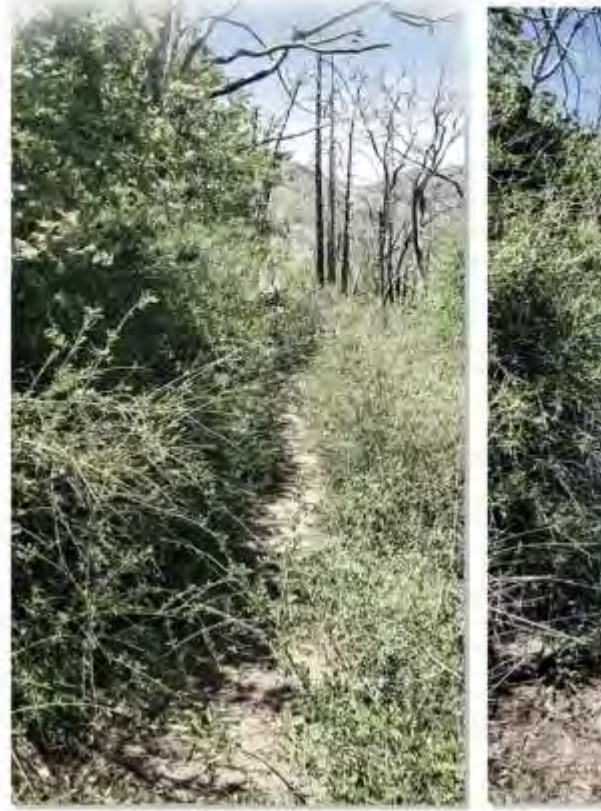
Before trail work started