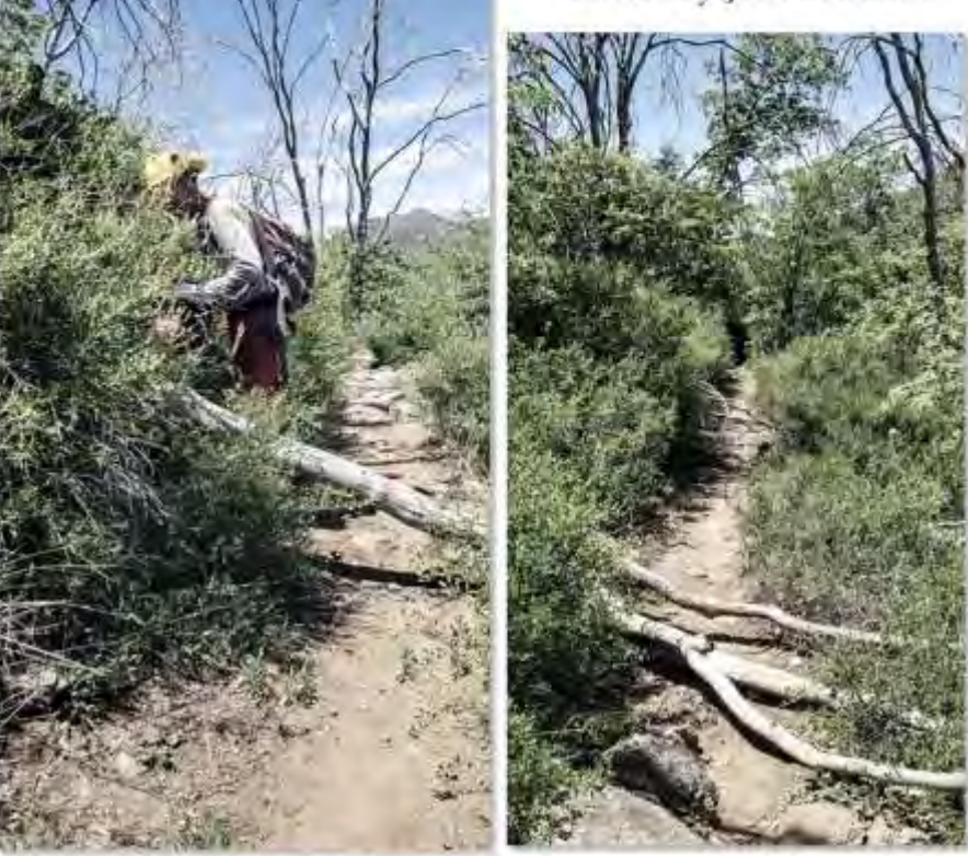
Clearing brush getting ready to saw some fallen trees.